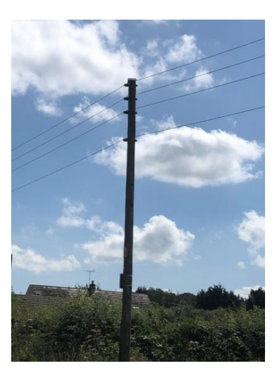
Figure 2 Uninsulated Conductor Low Voltage Overhead Power Lines