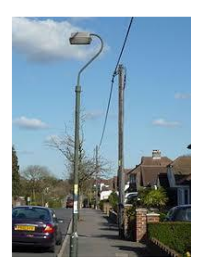
Figure 1 Aerial Bundle Conductor Low Voltage Overhead Power Lines

Examples of low voltage overhead power lines are shown below: