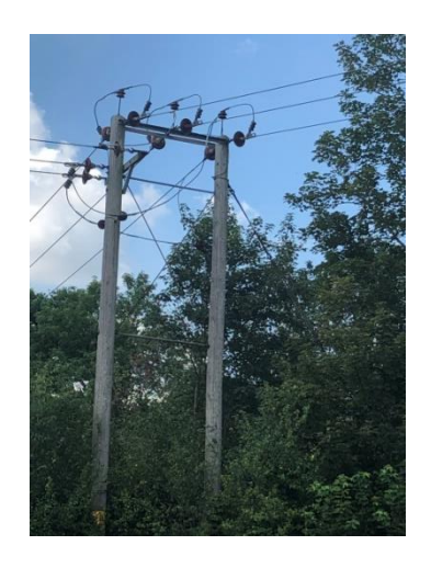
Figure 5 11kV Overhead Power Lines