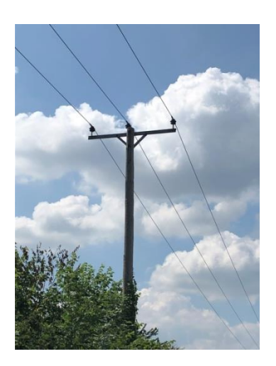
Figure 4 11kV Overhead Power Lines

Examples of high voltage overhead power lines are shown below: