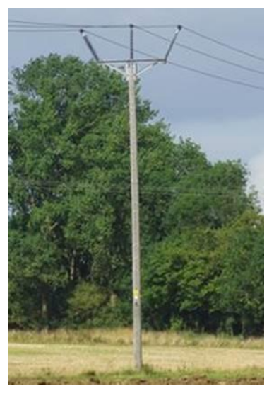
Figure 10 132kV Pole Mounted Triton Overhead Power Lines

Remember: it is vital to seek advice from your supervisor to establish the voltage and type of overhead power line to calculate the exclusion zone and stand off distance prior to starting work.